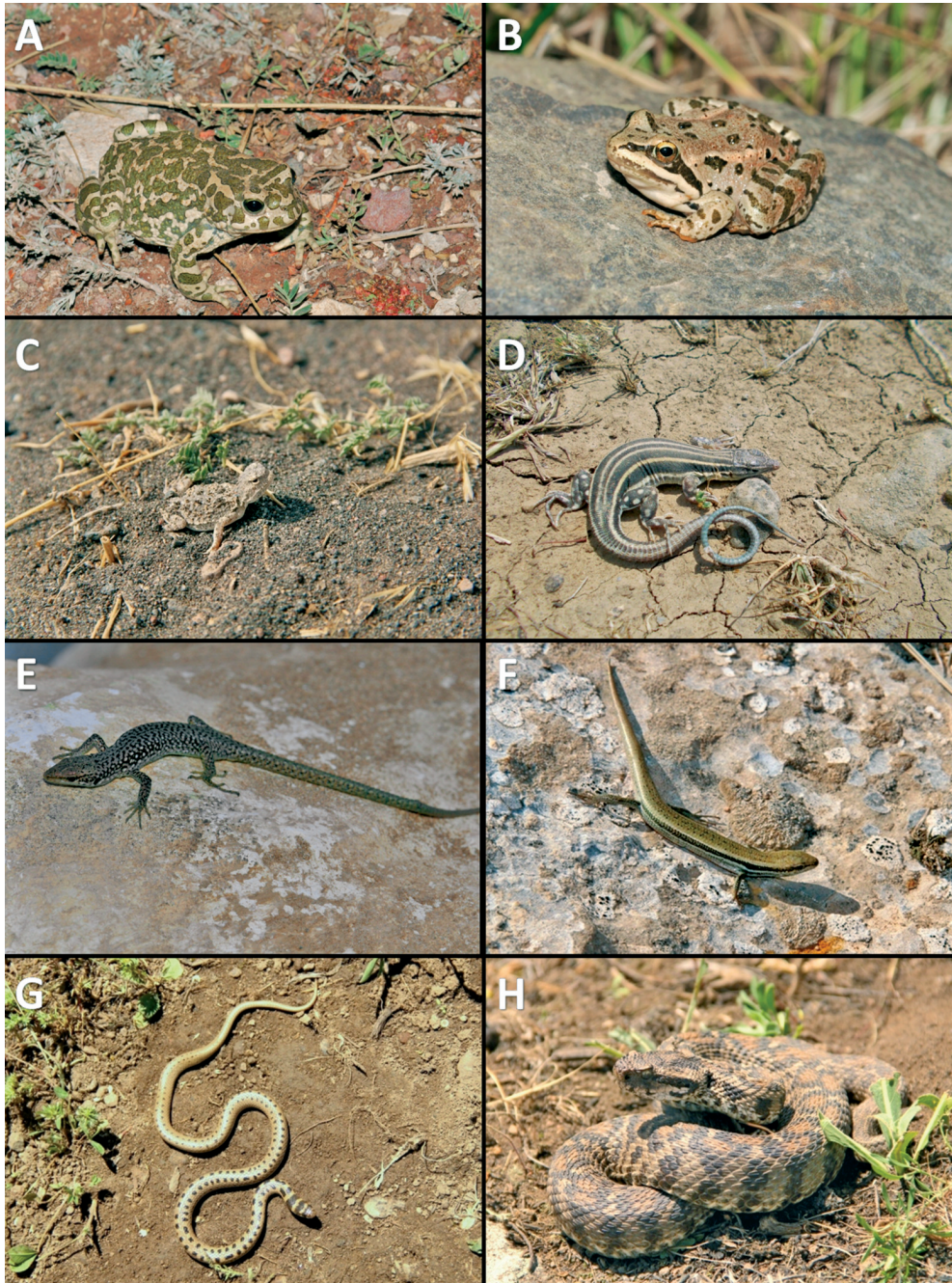
Fig. 2: Some amphibians and reptiles occurring in Ağrı. / Abb. 2: Einige Amphibien und Reptilien der Provinz Ağrı.

A – Bufo variabilis , B – Rana macrocnemis , C – Phrynocephalus horvathi , D – Eremias pleskei , E – Darevskia sapphirina , F – Ablepharus bivittatus , G – Eirenis eiselti , H – Montivipera wagneri.