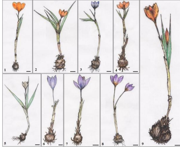
Figure 2. General drawing of Crocus taxa growing in Balikesir. 1. Crocus gargaricus , 2. C. chrysanthus 3. C. biflorus subsp. nubigena 4. C. flavus subsp. dissectus 5. C. candidus 6. C. pallasii subsp. pallasii 7. C. cancellatus subsp. mazziaricus 8. C. pulchellus 9. C. olivieri subsp. istanbulensis (Scale bar: 1 cm)