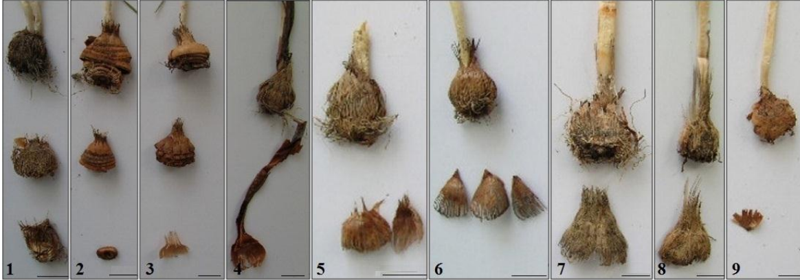
Figure 3. Corm types of Crocus taxa growing in Balikesir. 1. Crocus gargaricus , 2. C. chrysanthus 3. C. biflorus subsp. nubigena , 4. C. flavus subsp. dissectus 5. C. olivieri subsp. istanbulensis 6. C. candidus 7. C. pallasii subsp. pallasii , 8. C. cancellatus subsp. mazziaricus 9. C. pulchellus (Scale bar: 1 cm)

Throat of perianth of C. pallasii subsp. pallasii is colored whitish or lilac, while all other taxa are from pale yellow to yellow color. Again; C. flavus subsp. dissectus , C. olivieri subsp. istanbulensis , C. candidus and C. pulchellus have a style divided into 6-7 expanded branches, while other taxa have a style divided 3 expanded branches (Table 2; Figure 4).